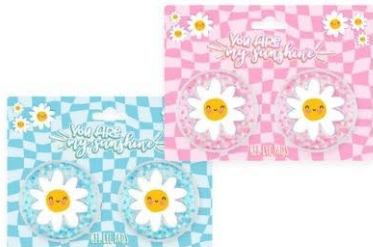
GEL EYE MASK $ 5.99