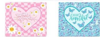
MAGNETIC HEART FRAME $ 3.99