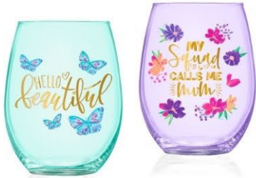
STEMLESS GLASS $ 14.99

PIARA WATERS PRIMARY SCHOOL Parents & Citizens Association FUNDRAISER