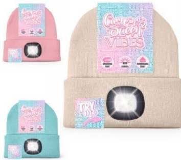
LED BEANIE $ 14.99