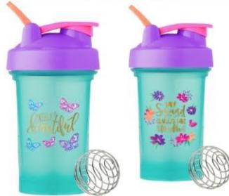
PROTEIN SHAKER $ 6.99