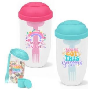
SALAD MATE $ 6.50