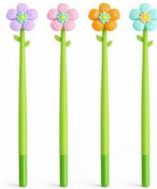
DAISY PEN $ 3.99