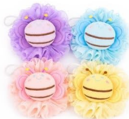
BEE LOOFAH $ 3.99

ORDERS CLOSE ON 28TH APRIL 2026 ORDERS WILL THEN BE DELIVERED TO YOUR CHILDS CLASSROOM ON WEDNESDAY 6TH OR THURSDAY 7TH MAY.