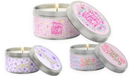
TIN CANDLE $ 7.99