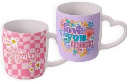
HEART MUG $ 8.50