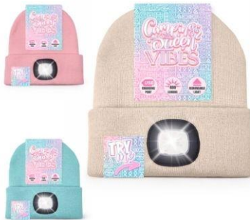
LED BEANIE $ 14.99