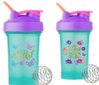
PROTEIN SHAKER $ 6.99