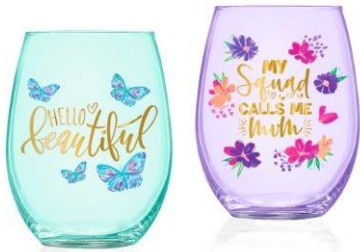
STEMLESS GLASS $ 14.99

PIARA WATERS PRIMARY SCHOOL Parents & Citizens Association FUNDRAISER