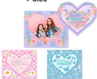
MAGNETIC HEART FRAME $ 3.99