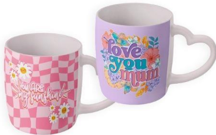
HEART MUG $ 8.50