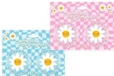
GEL EYE MASK $ 5.99