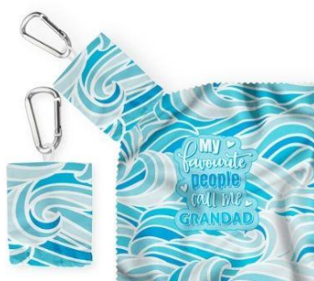
LEN CLEANER $3.95