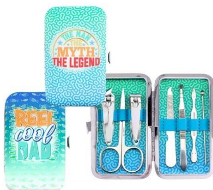
GROOMING KIT $7.95