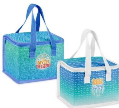
INSULATED LUNCH BAG $11.95