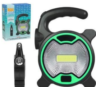
HANDY LANTERN $7.95