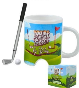
GOLF MUG & PEN $12.95