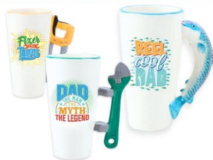
NOVELTY MUGS $13.95