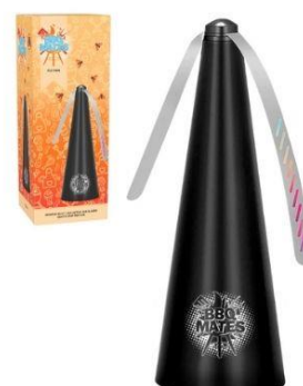
FLY FAN $11.95